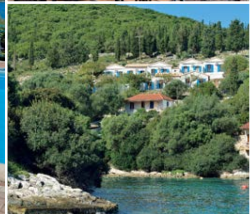
Kaminakia location (centre)