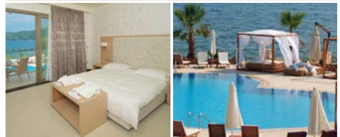
Beach near Sami