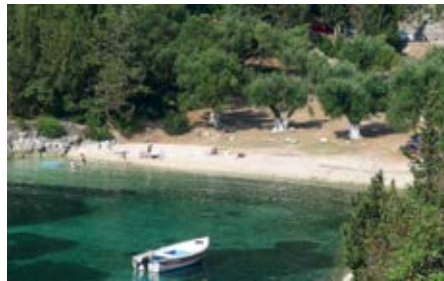
Foki beach, Fiscardo

Self Catering Studios for 2 Apartments for 2/4 Air Conditioning Swimming Pool Free WiFi