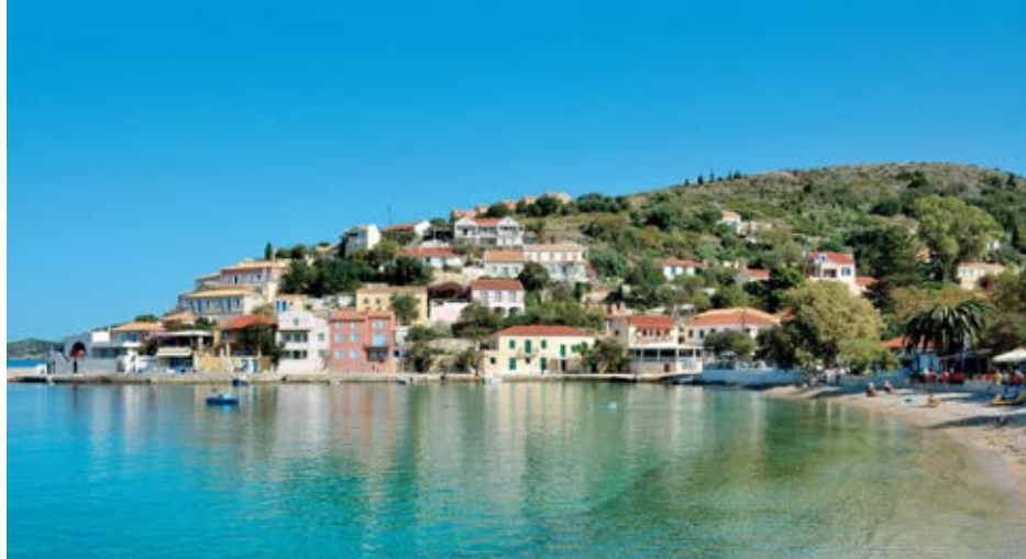
View from Apollonia Studios