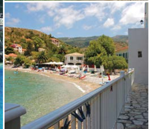
Path to the beach