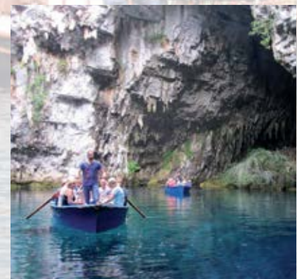
Melissani Cave and Lake